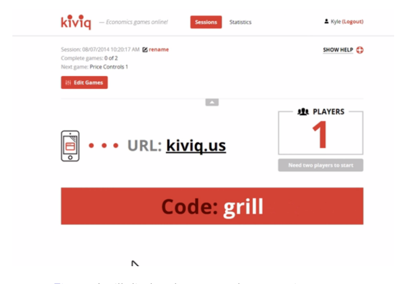
Figure: I will display the password to our private room