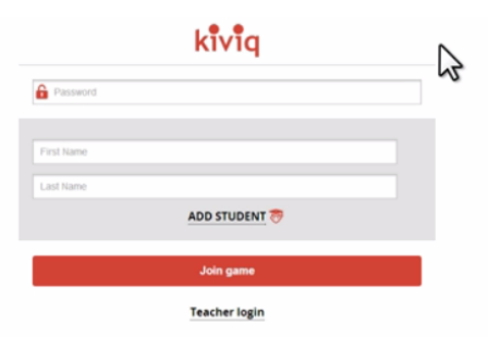
Figure: Log in with your first and last name