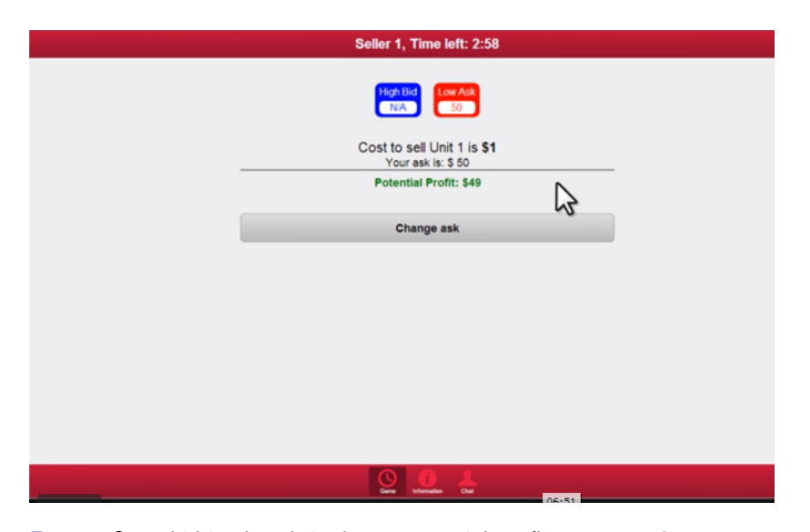
Figure: Once bid is placed, it shows potential profit, you can change your bid at any time