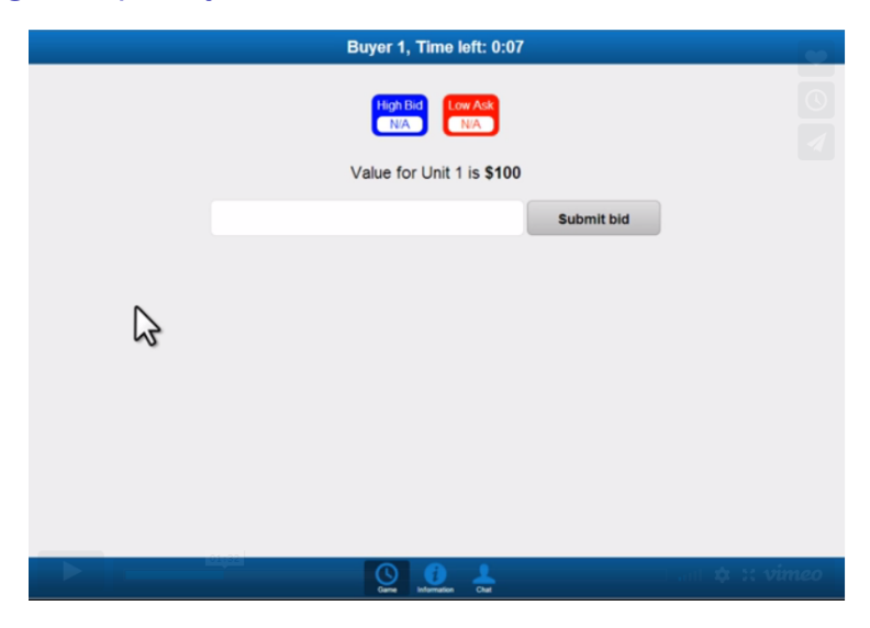
Figure: Buyers have blue screen, shows your value for the unit