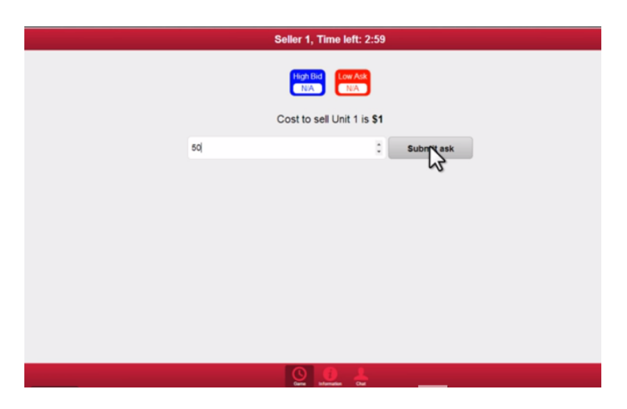
Figure: Enter your ask (current lowest ask shown at top)