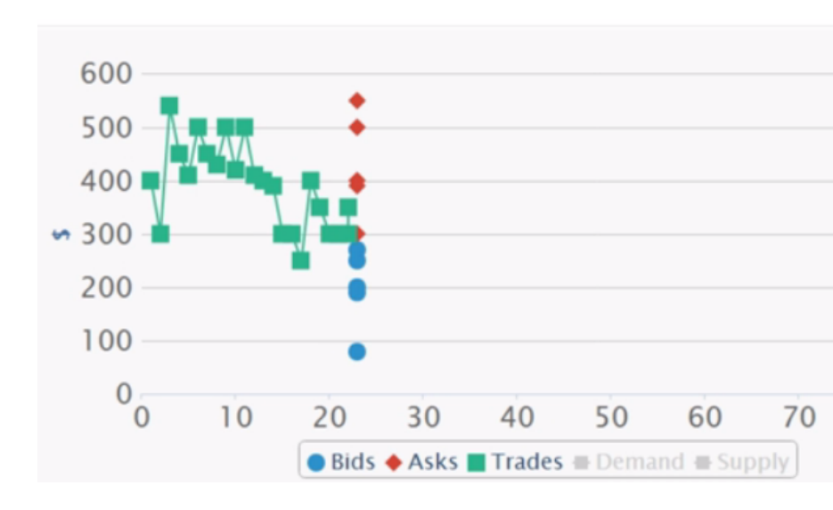
Figure: Screen at front shows bids, asks, trades, and price of each trade