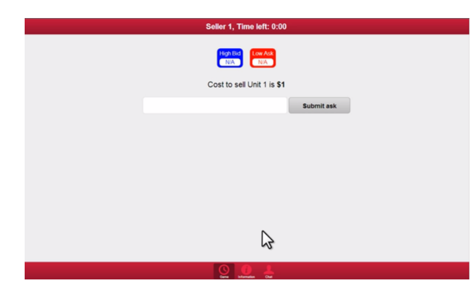
Figure: Sellers have red screen, shows your cost for the unit